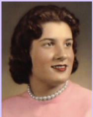
2nd WHS 1958 graduation photo